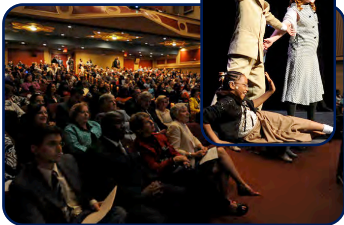
Students from West Side performed a number from Annie Jr.

Marietta Schools Foundations works hard to bring the community together with special events. For the past two year, the Marietta Schools Foundation organized a Gala event at the Strand Theatre. This event is a celebration of school success and is a showcase for students to perform at the beautiful Strand Theatre.